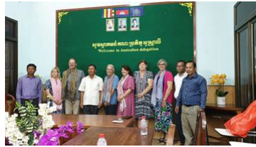
Some of the Australian delegation with Provincial Director of Education