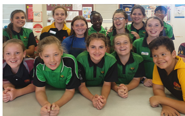
Year 6 students in Home Economics